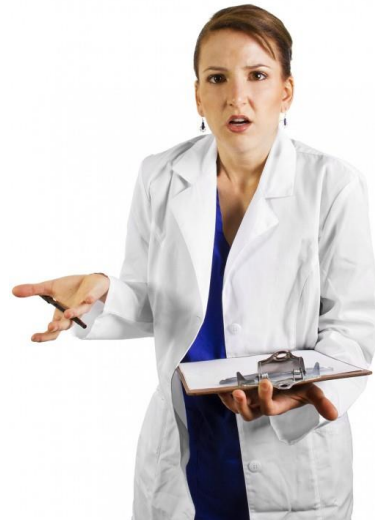
The “I-AM-GOING-TO-KEEP-CALLING-YOU-BY-THE-WRONG-PRONOUN” medical provider