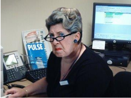
The “NOT-SO-HAPPY-YOU-ARE-HERE” receptionist