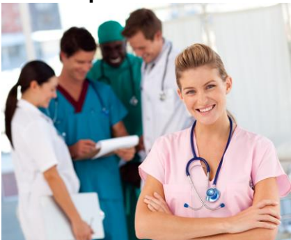
The “LET’S-HUDDLE-IN-A-GROUP-AND-GIGGLE” gang