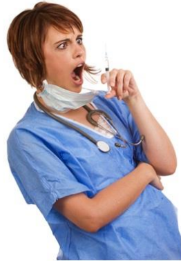
The “WHAT-THE-HELL-IS-THAT” medical assistant