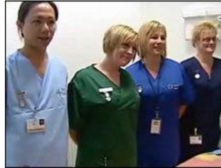
The “COME-LOOK-AT-THIS-EVERYONE” group